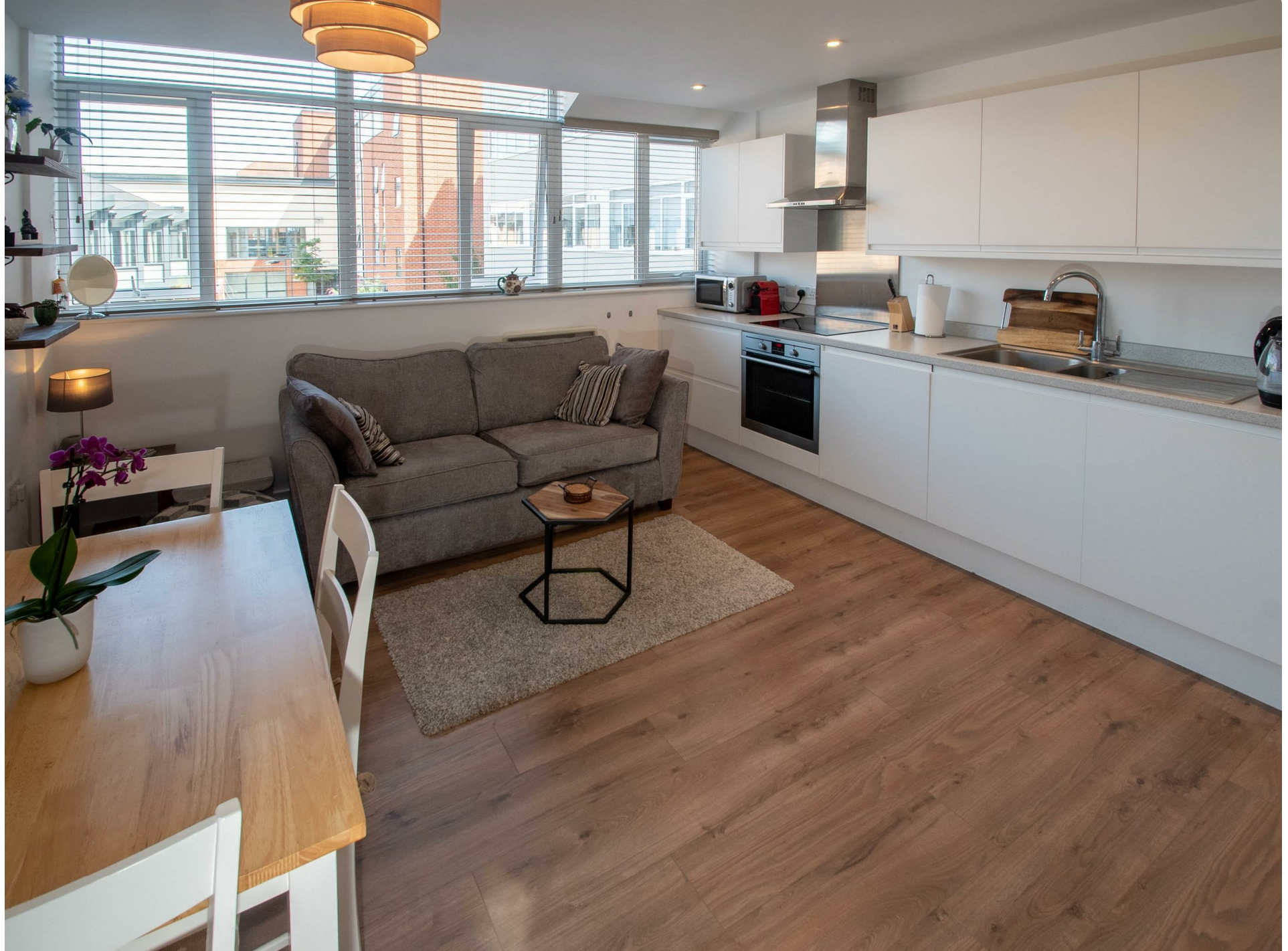
Kingshott House, Epsom